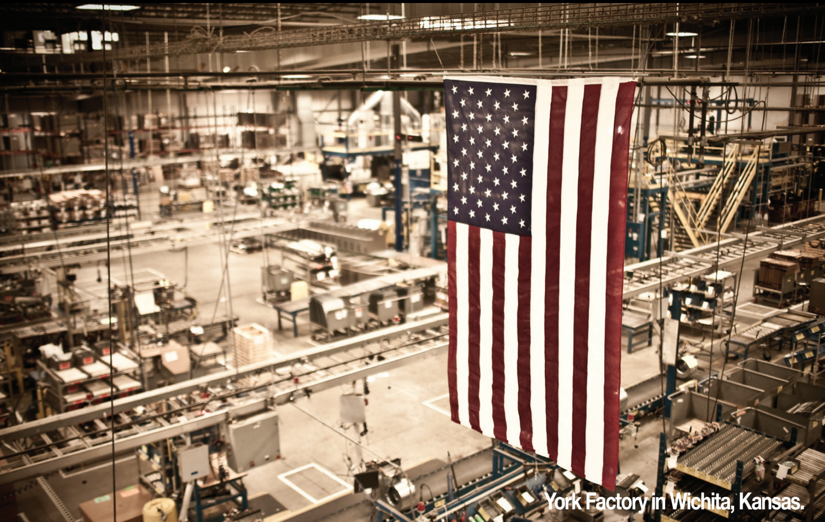
York Factory in Wichita, Kansas.

York Residential Heating & Cooling Products are assembled in Wichita, Kansas.