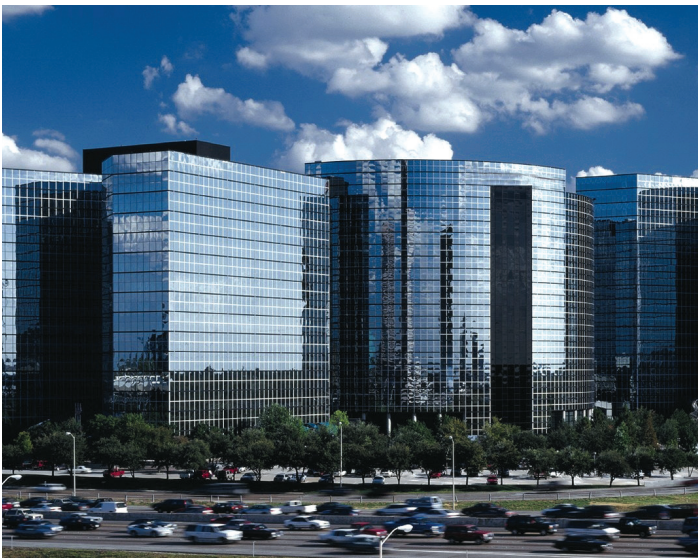
CORPORATE HEADQUARTERS | DALLAS, TX